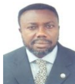
Agbeli DEH Agbalṵtata