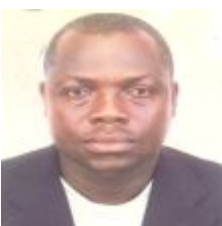
Kudzo ALOTSI Sukuwo meyiṵi Gbegṵmedṵṵṵ