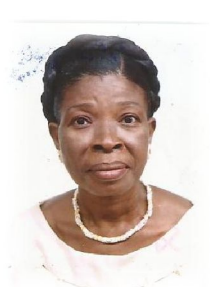
Mawussé AWU - ADZRY, ALLAHARE srṵ Nyametsotso(Zimenṵla) Lé be na Eṵegbea